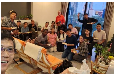
Celebrating Thanksgiving with our staff