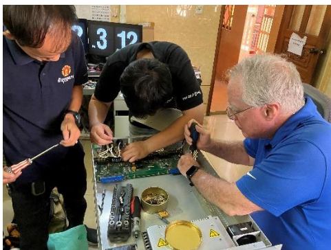
Repairing Nautel Transmitter