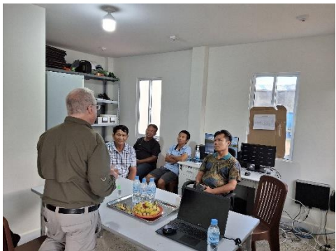
Mentoring the FEBC Cambodia Tech Team