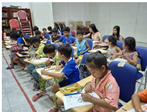
Teaching Bible Stories in English