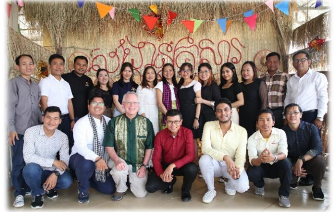
FEBC CAMBODIA STAFF

the project. It was challenging since the temperature each day was near or above 100 degrees, but thankfully, the team was able to complete the work. Once again, thank you for your prayers.